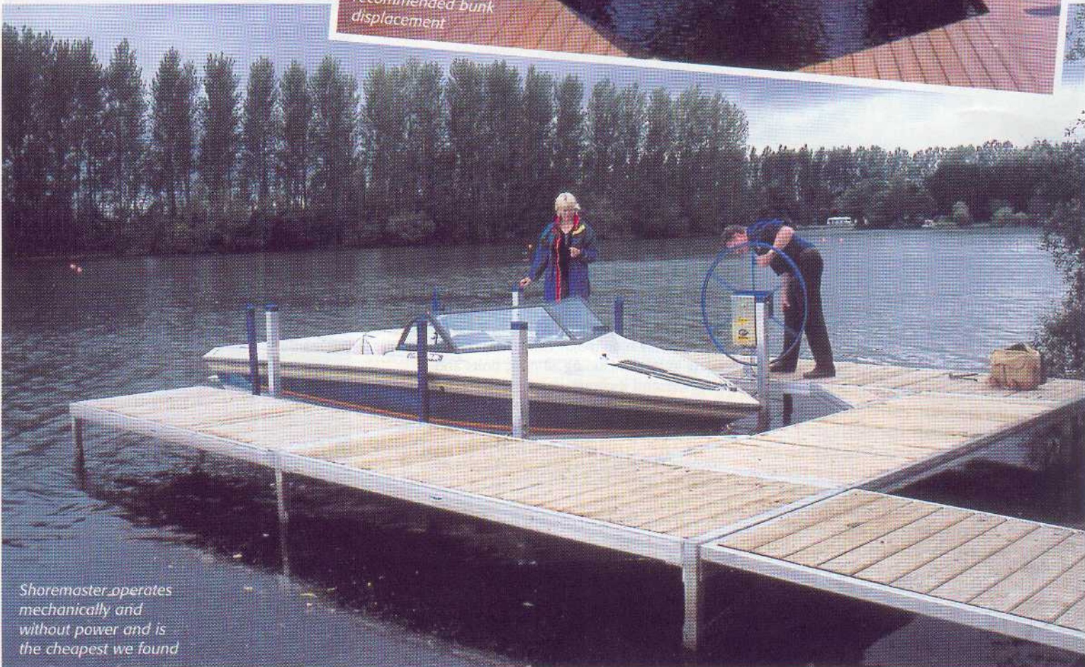
Shoremaster operates mechanically and without power and is the cheapest we found