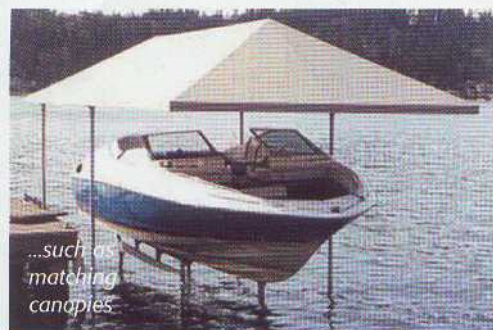
...such as matching canopies

Similar to the Hydrohoist system is the AirBerth Boat Lift. We first saw this lift impressively in action at this year's Ribex show. Wave Seven Marine, the UK distributor for the lifts, teamed up with the Cowes Inshore Lifeboat to demonstrate the ease and speed with which Air Berth scooped the huge RIB into the air. The lifeboat was driven onto the submerged AirBerth and the positioning ropes secured her in position. Once the hoses from the portable Dockbox Air Control were attached the displacement of water from the primary floats started. Within minutes, the