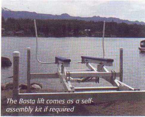
The Basto lift comes as a self-assembly kit if required

lifeboat centred itself and AirBerth shaped to her hull.