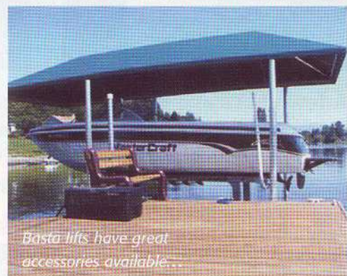
Basic lifts have great accessories available...