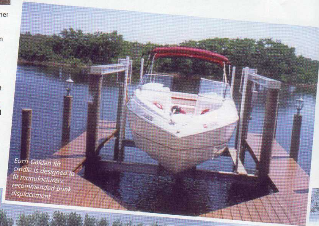
Each Golden lift cradle is designed to fit manufacturers recommended bunk displacement

boards, guide poles, and electrical switches. There are no plastic parts to wear and the pulley or chain covers are cast aluminium and are fitted with maintenance free, oil bath gearboxes. These lifts carry a ten year structural warranty, a five year warranty on the drive system and two years on all other parts. Each boat lift cradle is engineered and designed to fit the boat manufacturer's recommended bunk placement. Prices start from just under £4,000 and because of the many different types of lifts it is best to call for installation prices. We have to admit to not seeing this one in the flesh.