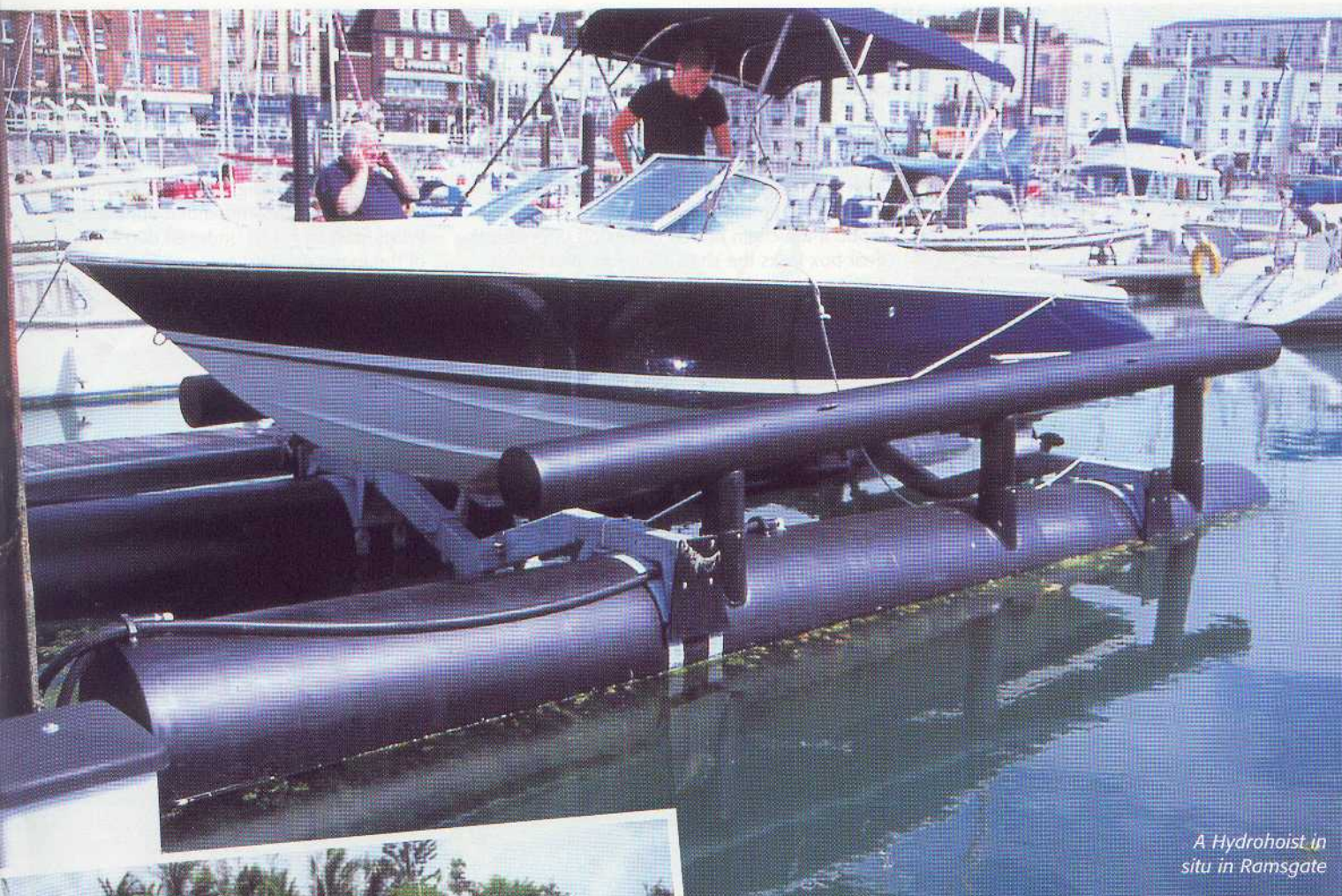
A Hydrohoist in situ in Ramsgate