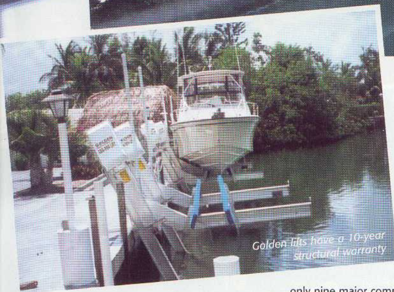
Golden lifts have a 10-year structural warranty

Our search for boat lifting excellence took us next to Yorkshire. MasterCraft Europe are the European distributors for the Basta Marine Over-Center (formerly called Nyman Boat Lift). The locking design of this lift is very simple and efficient. Powered by a 12v solar charging system it can be remotely controlled or manually operated. This lift is very fast, travelling up or down in just 40 seconds. Available in aluminium and galvanised steel, it is suitable for both fresh and salt water installations. It is very easy to assemble, in fact Ian Birdsall from MasterCraft erected one in under an hour for their stand at last year's London show and he assured me a novice could have his erect in