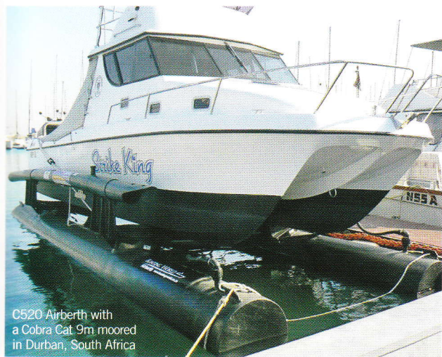
C520 Airberth with a Cobra Cat 9m moored in Durban, South Africa