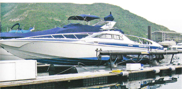
M1500 Airberth with 55' FB Design Boat moored in Hong Kong SAR, China

For further information visit www.airberth.com